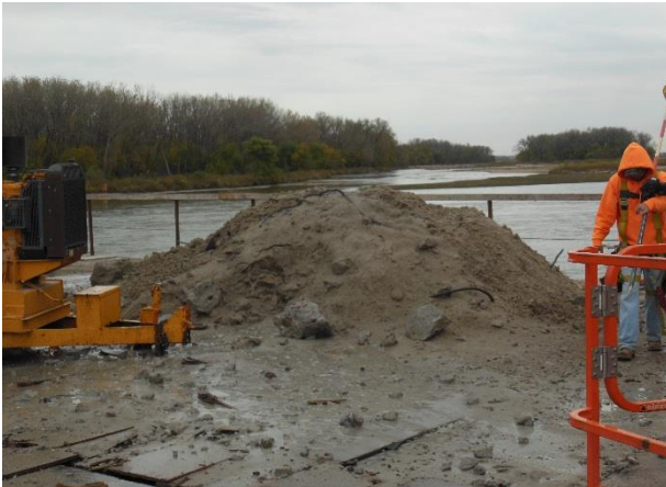
October 22, 2015 – Photo showing example of debris removed from Pier #5.