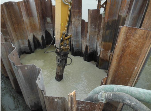
October 22, 2015 – Photo showing final demolition of Pier #5.