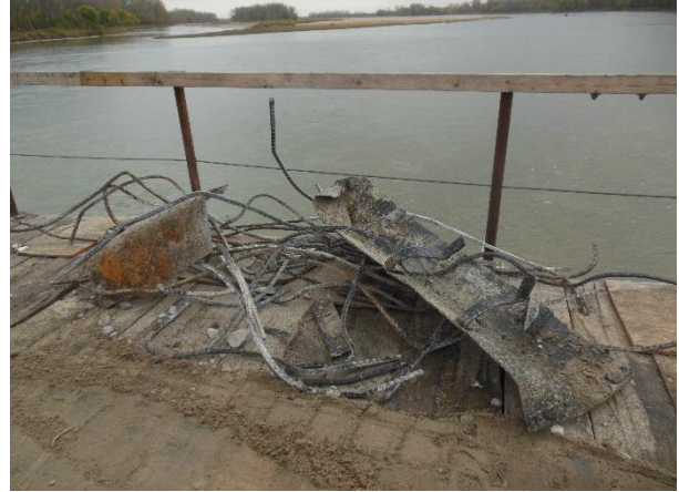
October 22, 2015 – Photo showing steel reinforcement removed from Pier #5.