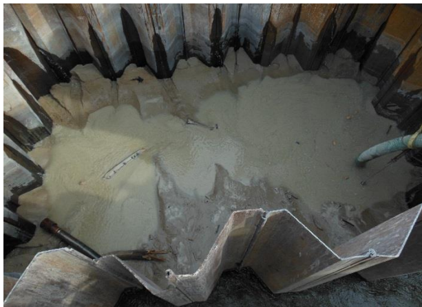
October 22, 2015 – Photo showing final excavation of pier #5.