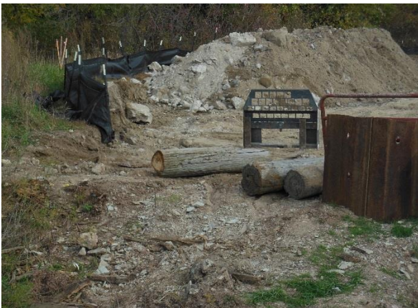
October 22, 2015 – Photo showing cut off bollards.